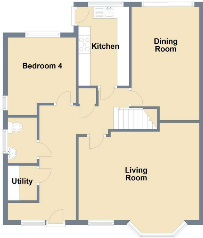
Ground Floor Approx. 68.9 sq. metres (741.6 sq. feet)